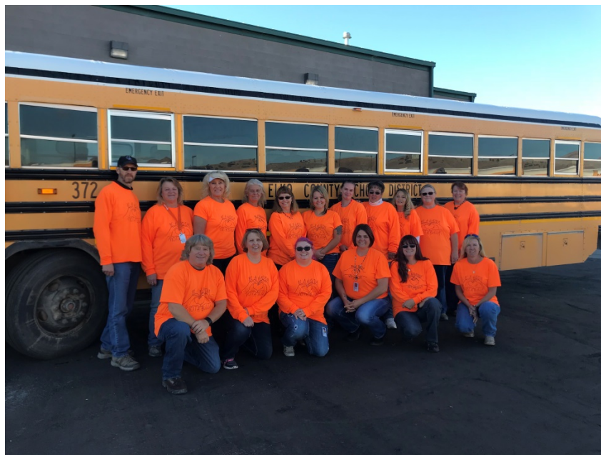
Elko County School District Bus Drivers in their Anti-bullying Shirts